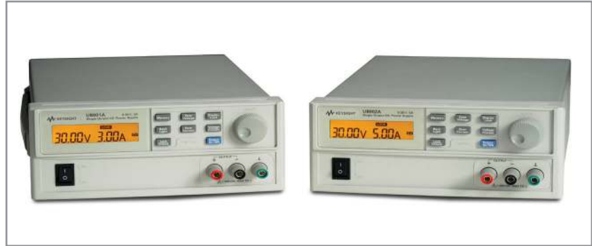
Figure 1. The U8001A 90 W and U8002A 150 W single output DC power supplies