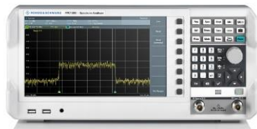
More than a spectrum analyzer Value of three