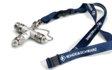
Combined OSL calibration kit (R&S FSH-Z29)