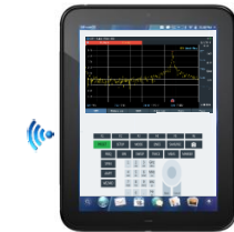
Tablet with Android / iOS app to remote control the analyzer