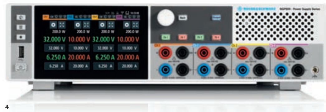
R&S®NGP800 Power Supply Series