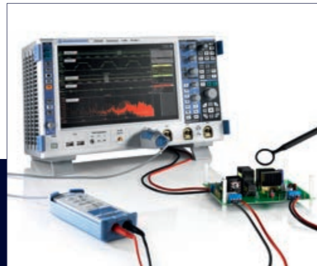
R&S®RTO 2044 Oscilloscope