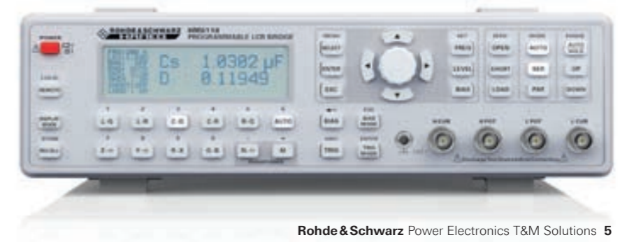
R&S®HM8118 Programmable LCR Bridge