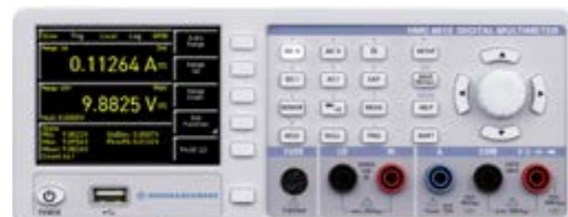
R&S®HMC8012 Digital Multimeter