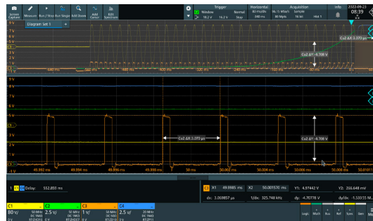
Fig. 3: PWM details in steady state of the converter

This complex measurement is only possible with the large memory of the R&S®MXO 4. Only 80 Mpoints of the 400 Mpoints of available memory were used. Longer startup sequences or higher sampling rates can also be verified.