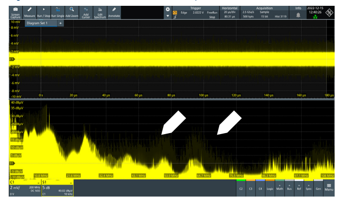
Fig. 2: Conducted emission measurement on the power lines.

A confirmation can be obtained with the last step (see Fig. 3). In this measurement, the normal trigger mode is activated where the SPI communications port is measured with a passive probe (channel 3). The spectrum is displayed at the same time. The result shows that as soon as the SPI communications between the controller and receiver have started (trigger event), a high broad emission appears on the display. Knowing the details, activities can be defined to limit this emission, which is caused by SPI bus activities and reflected into the conducted emissions on the power line.