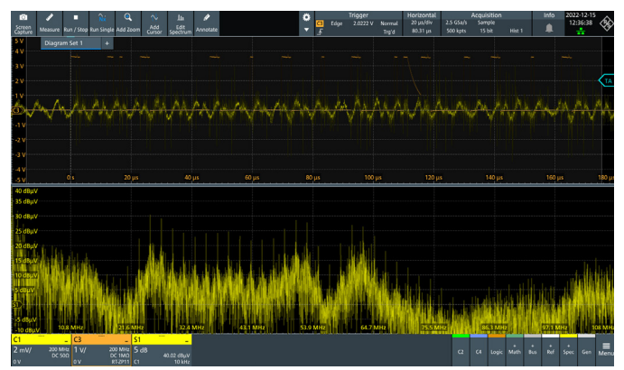
Fig. 3: EMI spectrum while SPI data is transmitted.

A confirmation can be obtained with the last step (see Fig. 3). In this measurement, the normal trigger mode is activated where the SPI communications port is measured with a passive probe (channel 3). The spectrum is displayed at the same time. The result shows that as soon as the SPI communications between the controller and receiver have started (trigger event), a high broad emission appears on the display. Knowing the details, activities can be defined to limit this emission, which is caused by SPI bus activities and reflected into the conducted emissions on the power line.