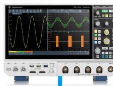
MXO series oscilloscope